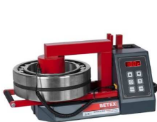
BETEX 24 RLD/ portable