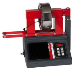
BETEX 22 ESD/