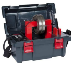
BETEX 22 ELD/ portable