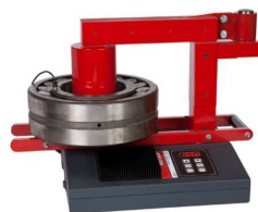
BETEX 24 RSD/